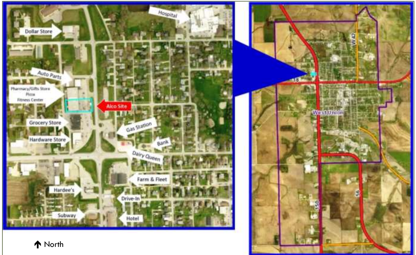
FIGURE 3: SITE MAP

We invite you to visit our community and meet our city leaders, business owners and residents to learn more about this resilient city. West Union was featured in a Larry King segment about building local economic sustainability. For a look at our community, view the video here: https://www.youtube.com/watch?v=RwSrdRU8VhE