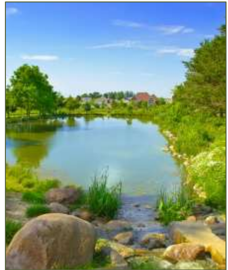
FIGURE 2: WEST UNION RECREATION COMPLEX

The West Union Community Library is open Monday through Friday and offers a large collection of materials, scheduled activities for all ages and internet access for the community. The library staff can provide numerous services, from helping patrons with electronic forms and computer navigation to proctoring exams.